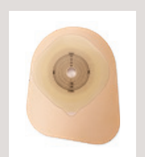
Figure 1 CeraPlus one-piece pouching system with flat cut-to-fit skin barrier.